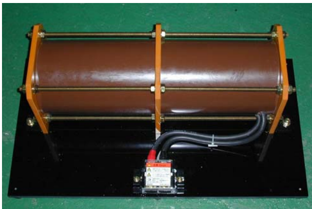
Air-cooling type magnetizing coil, transverse-style